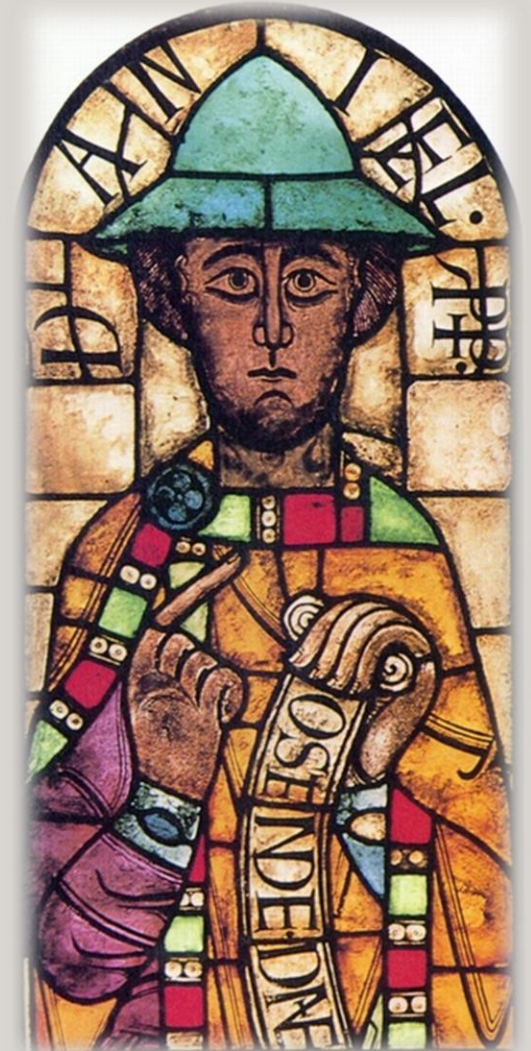
Daniel 12 th Century Domkirche (Augsburg, Germany)

Word of God, Word of Life. Thanks be to God