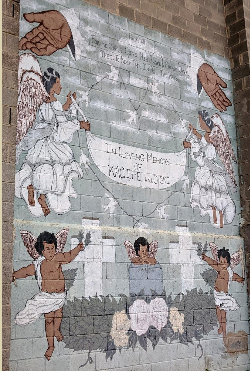
"In Loving Memory..." Street Mural Baltimore, MD