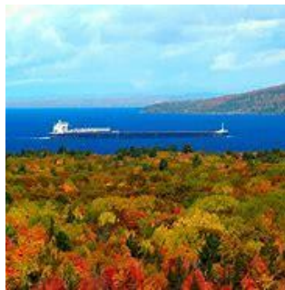
The Colors Will Be Here Before We Know It