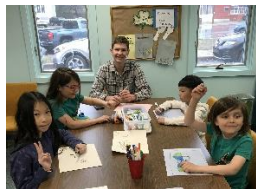
Kids in Sunday School draw critters that start off as caterpillars and become butterflies.