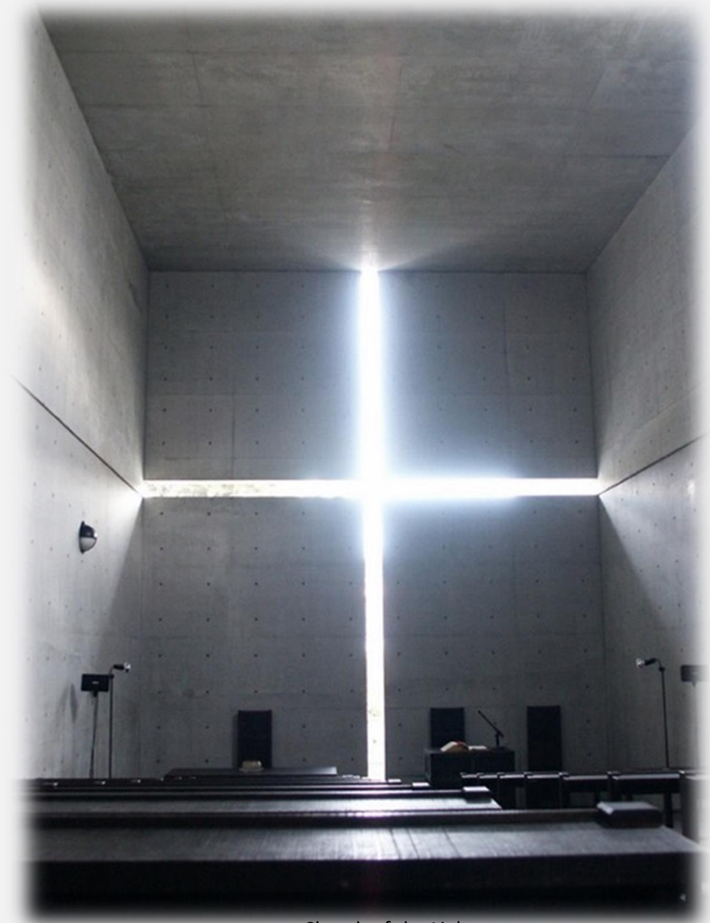
Church of the Light Tadao Ando Ibaraki, Japan

Through Jesus Christ, we are forgiven! Thanks be to God!